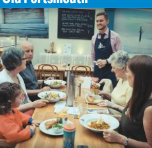
Traditional English pubs, restaurants and tea rooms in the historic cobbled streets of Old Portsmouth